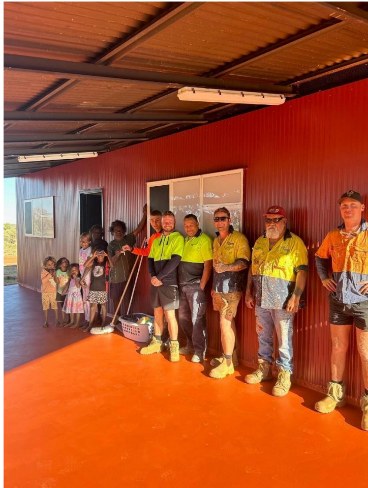
Picture of job completion handover with primary residents. Refer to 3.4 Talent Release Form

The total labour hours expended on this project included 20% participation by Aboriginal staff and/or sub-contractors.