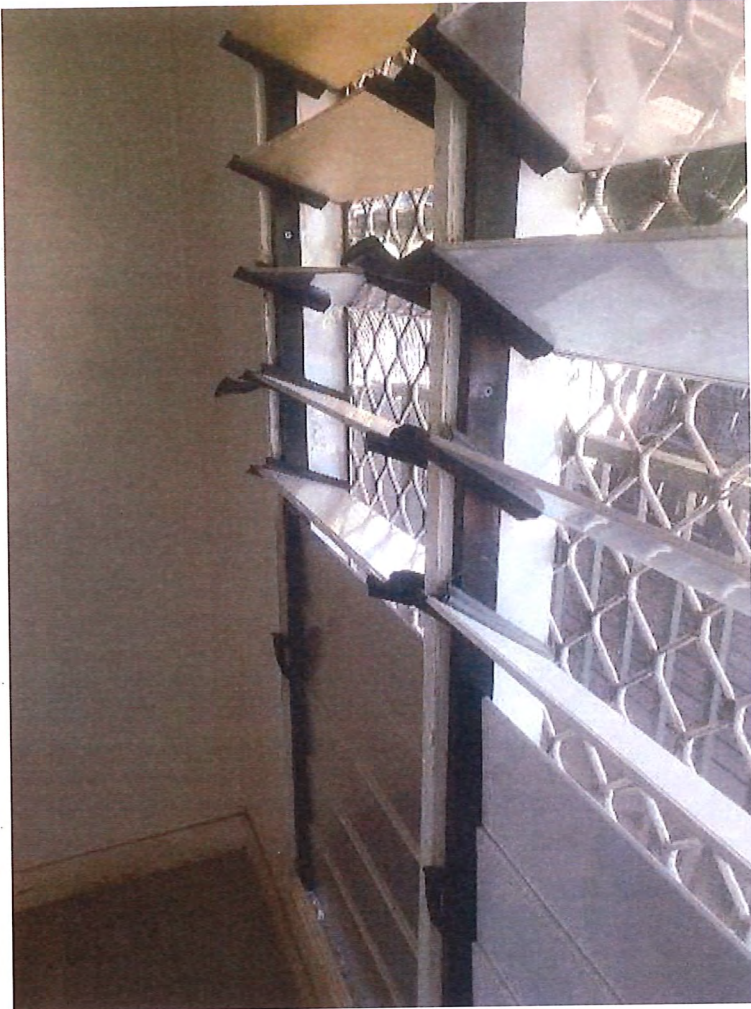
New Louvres and Galleries throughout