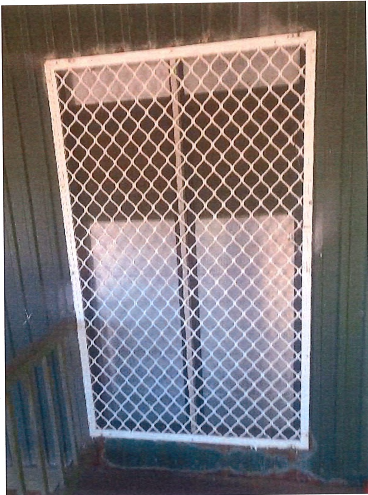
New Screens throughout