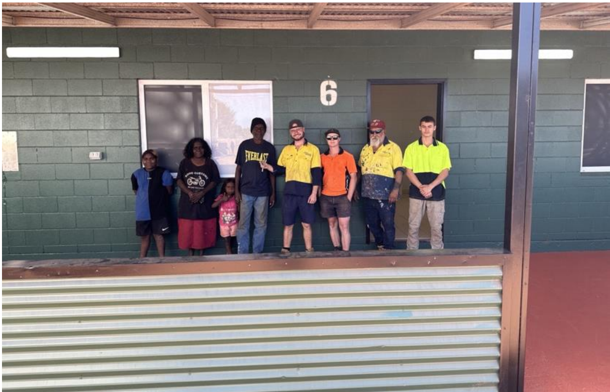
Picture of job completion handover with primary residents. Refer to 3.4 Talent Release Form

The total labour hours expended on this project included 40% participation by Aboriginal staff and/or sub-contractors.