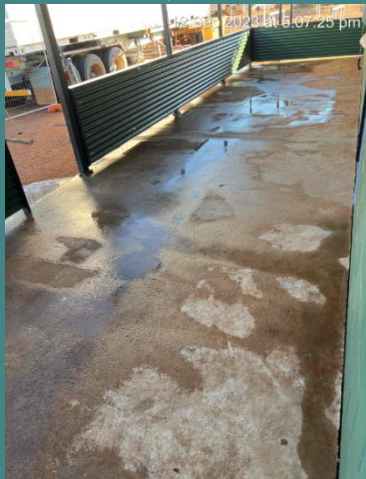
Before Laundry & Exterior works commenced: