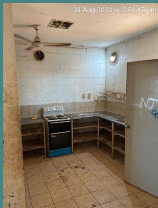
Before works commenced: