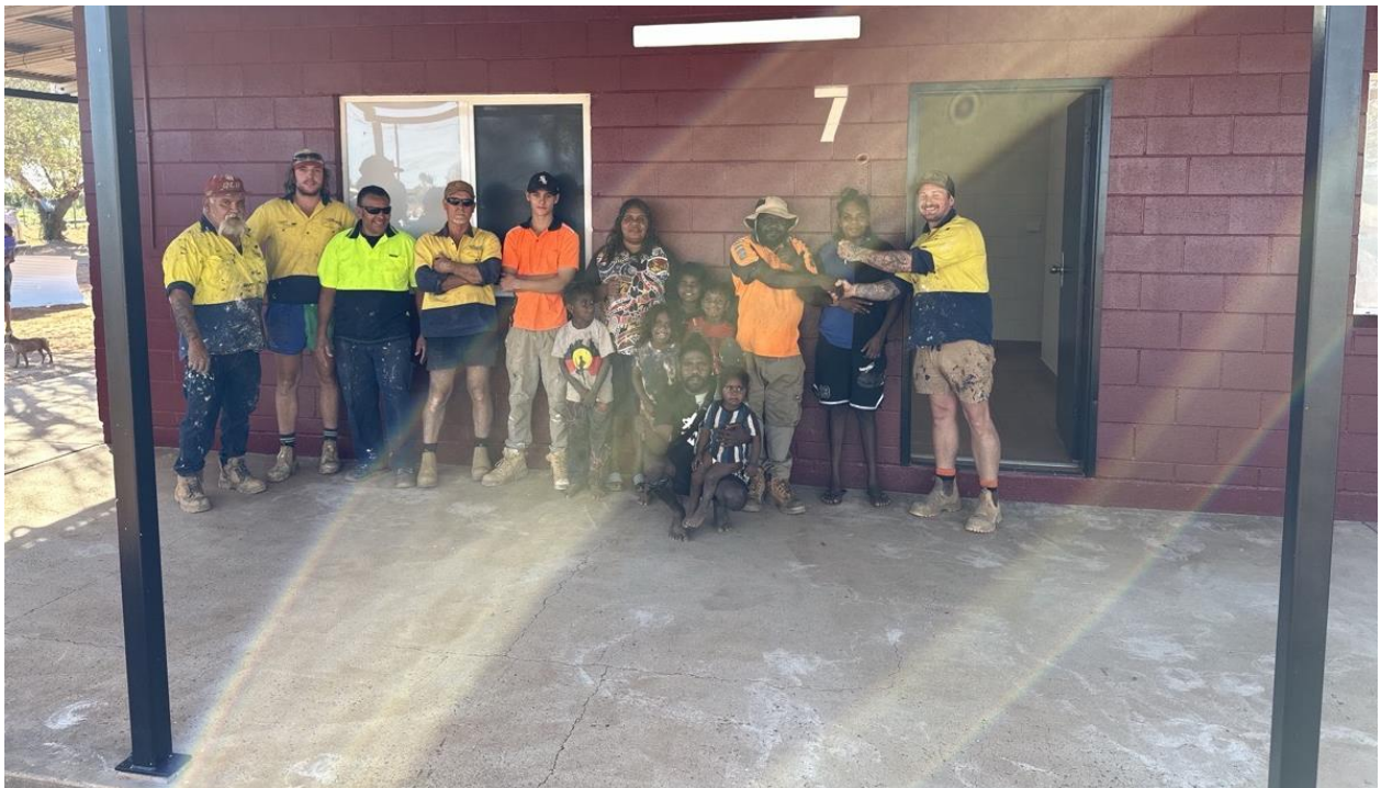
Picture of job completion handover with primary residents. Refer to 3.4 Talent Release Form

The total labour hours expended on this project included 48% participation by Aboriginal staff and/or sub-contractors.