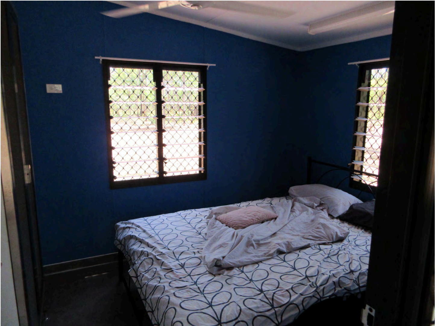
New Bedroom Installation