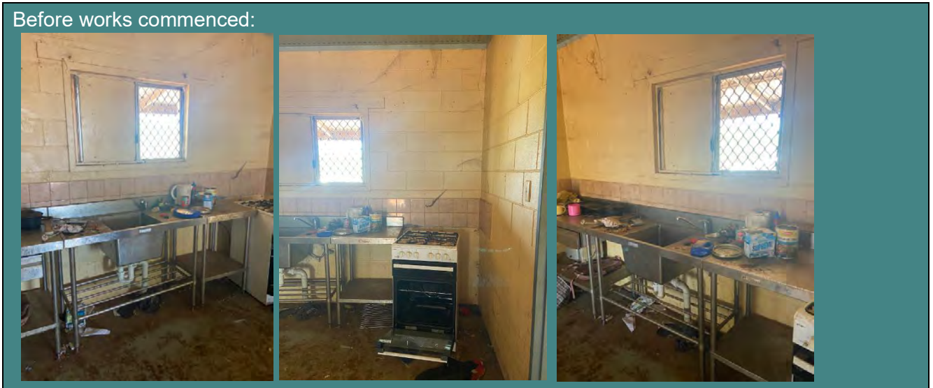
Before works commenced: