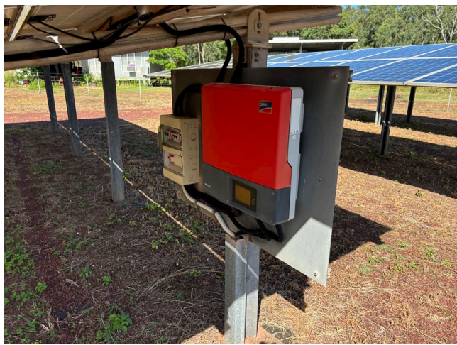
Faulty PV inverter