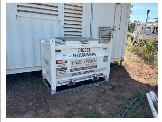
New Tank 1000ltr bundled