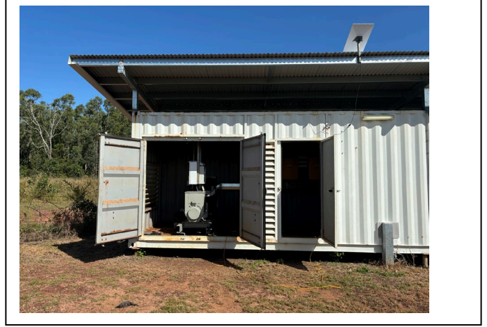
New roof and Genset