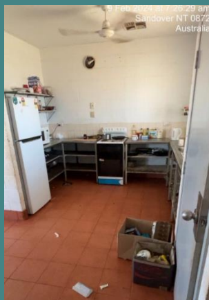
Before works commenced: