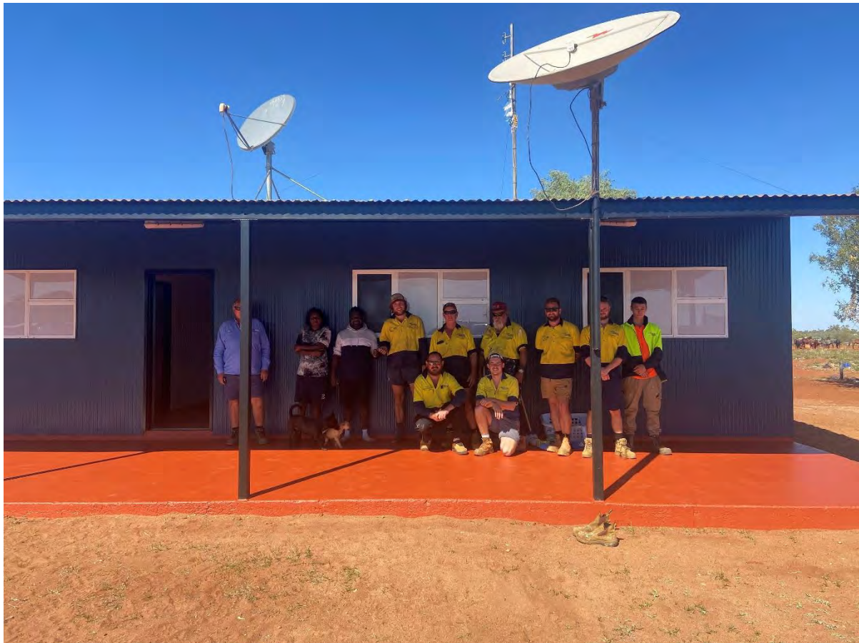
Picture of job completion handover with primary residents. Refer to 3.4 Talent Release Form

The total labour hours expended on this project included 25% participation by Aboriginal staff and/or sub-contractors.