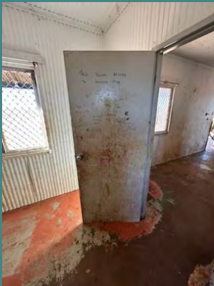
Before works commenced: