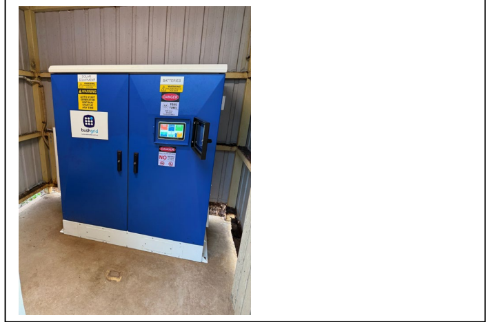
New inverter enclosure