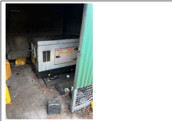
Old generator which has now auto start hardwired