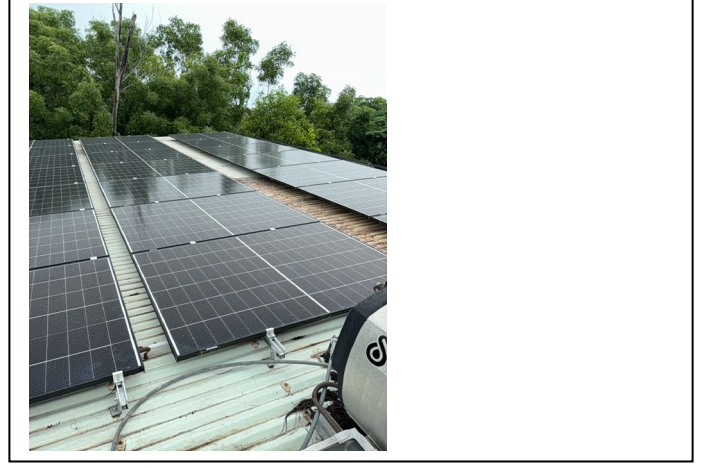
New solar on house 1 as house 2 is not suitable atm