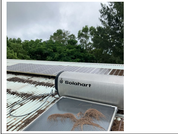
Old solar panels on house 1 removed