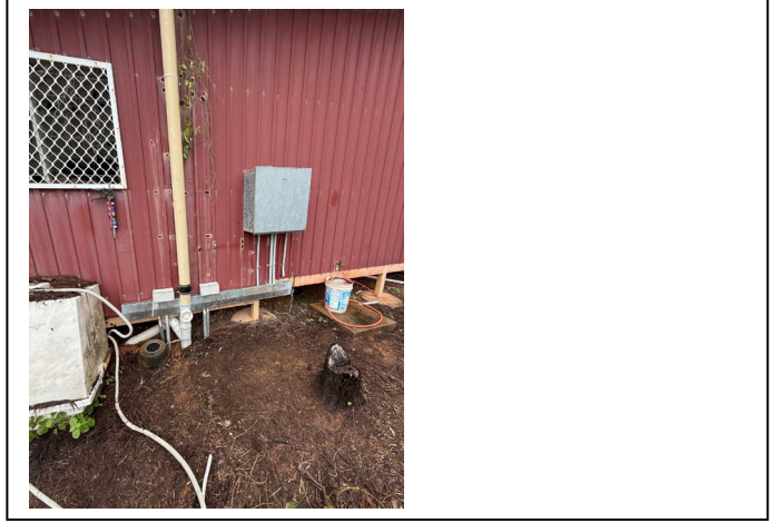
Repaired conduit and cabling