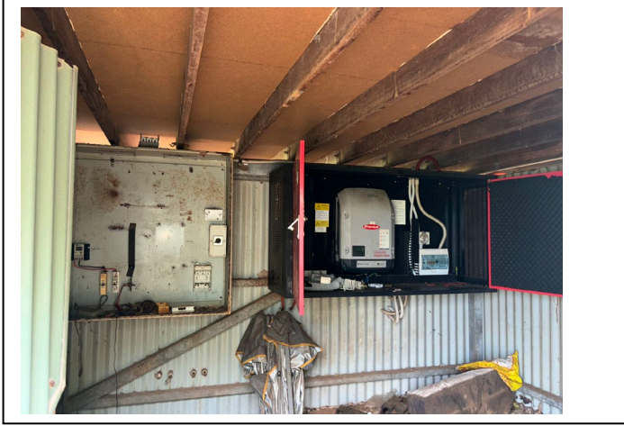
Old inverter enclosure