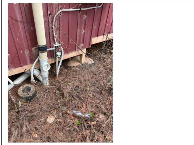
Old damaged conduit and cabling