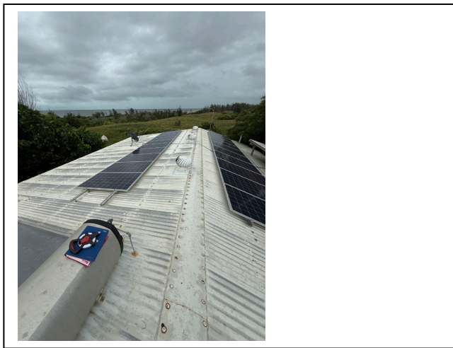
House 2 roof and old solar de commissioned