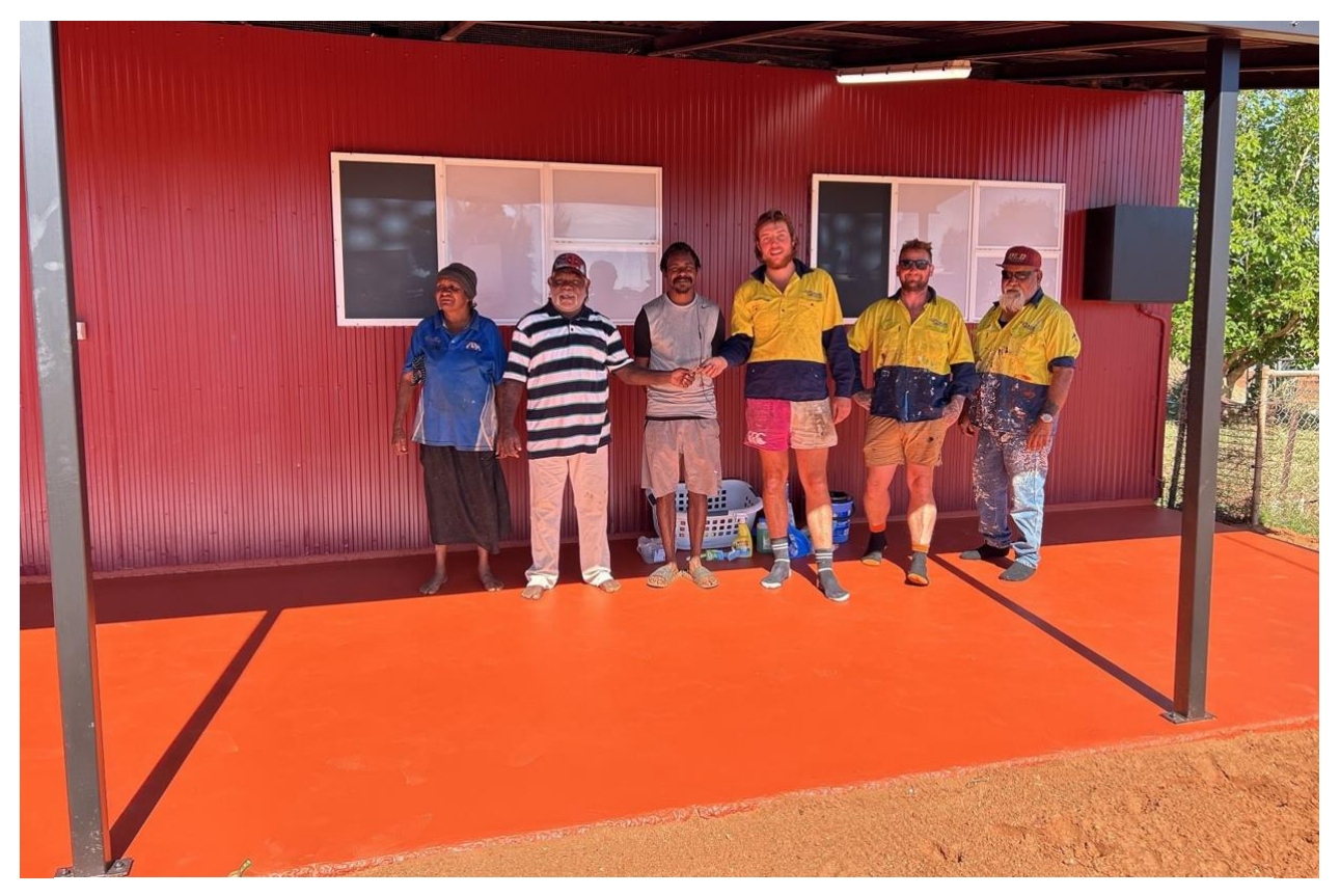
Picture of job completion handover with primary residents. Refer to 3.4 Talent Release Form

The total labour hours expended on this project included 34% participation by Aboriginal staff and/or sub-contractors.