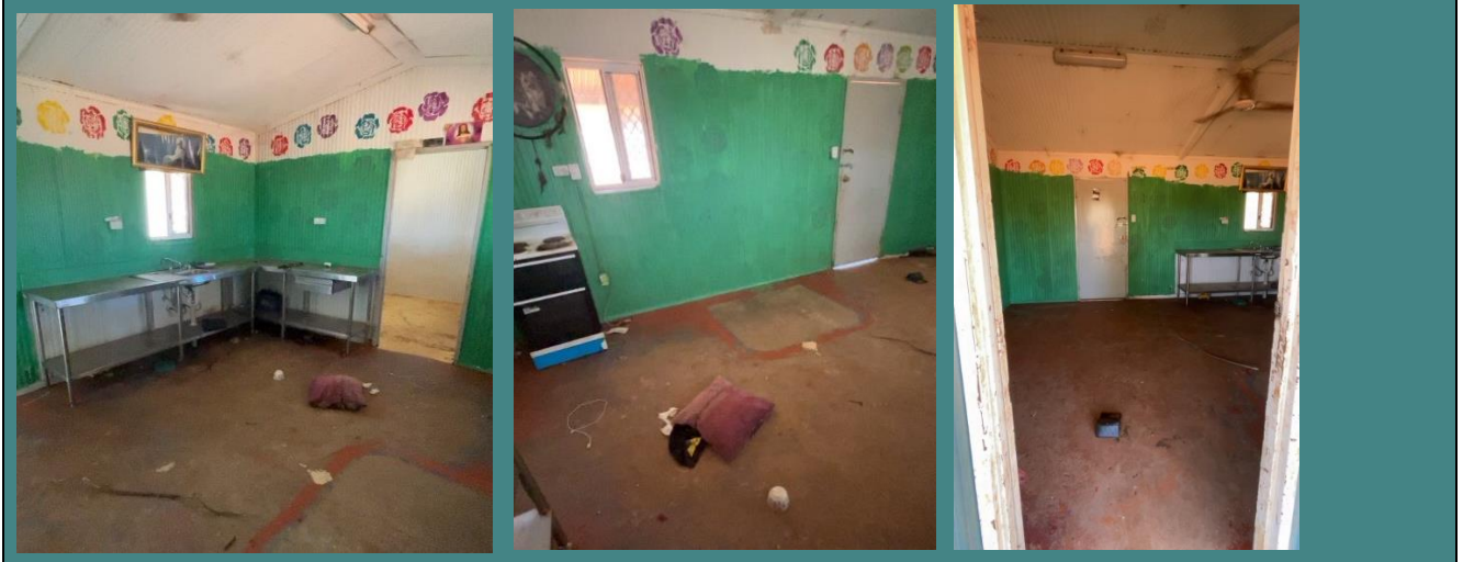
Before works commenced: