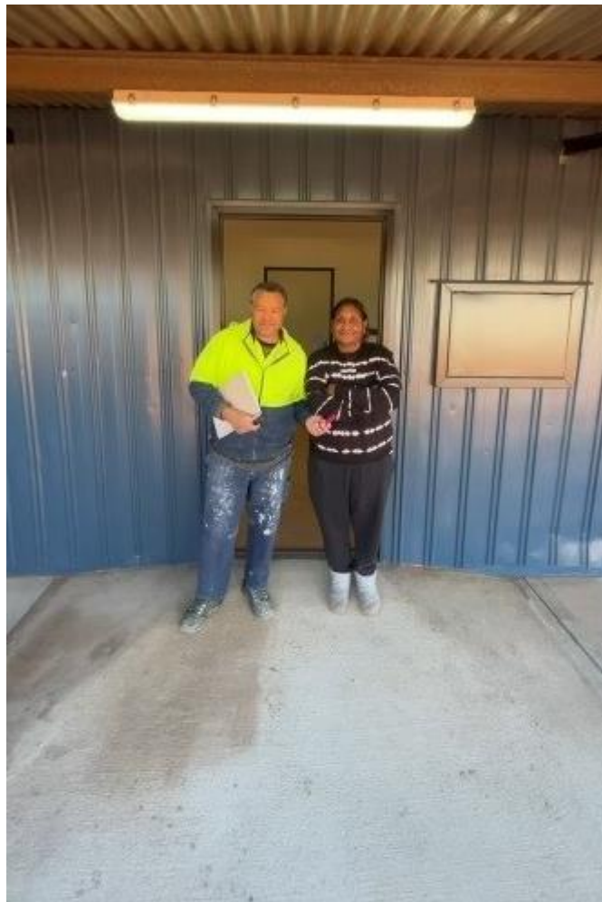
Picture of job completion handover with primary resident. Refer to 3.4 Talent Release Form

The total labour hours expended on this project included 28% participation by Aboriginal staff and/or sub-contractors.