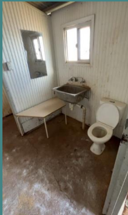
Before Bathroom & Toilet works commenced: