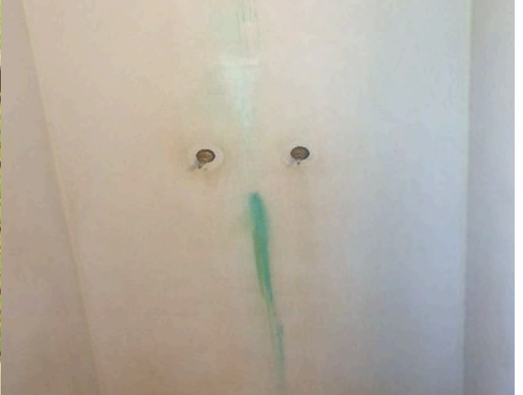
The new replaced roof and hot water system, along with the new front decking. The stair treads replaced and the extent of the leaking breach in the downstairs bathroom. New screen installation was completed and window louvres cleaned during this process.