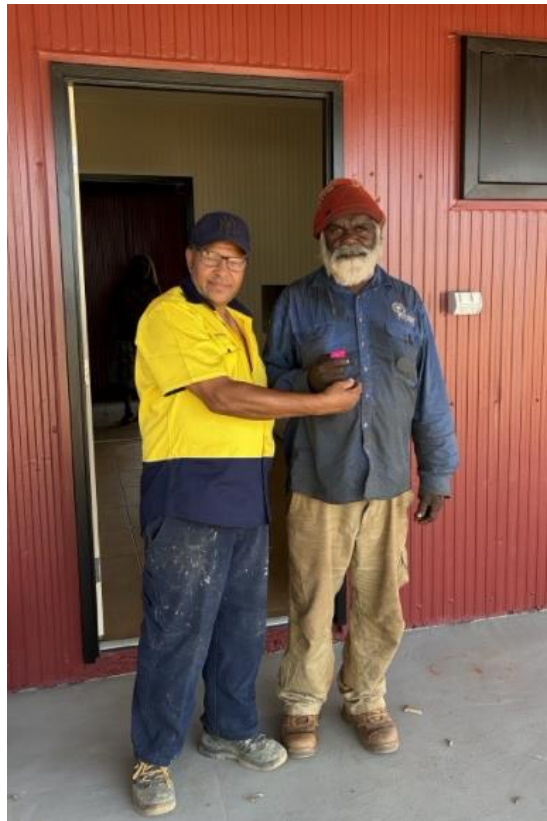
Picture of job completion handover with primary resident. Refer to 3.1 Talent Release Form

The total labour hours expended on this project included 34% participation by Aboriginal staff and/or sub-contractors.