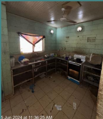
Before works commenced: