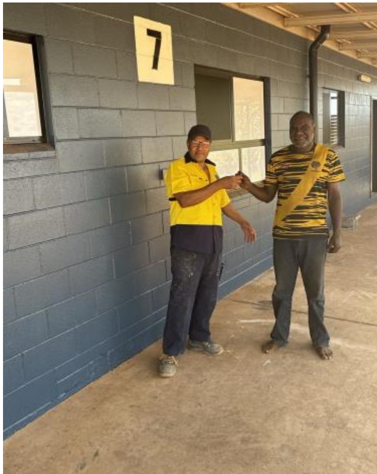
Picture of job completion handover with primary resident. Refer to 3.1 Talent Release Form

The total labour hours expended on this project included 22% participation by Aboriginal staff and/or sub-contractors.