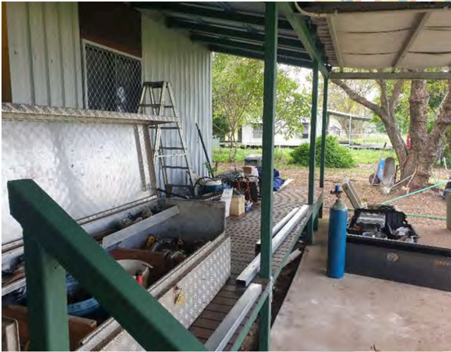
Outside front of house before disabled ramp was installed