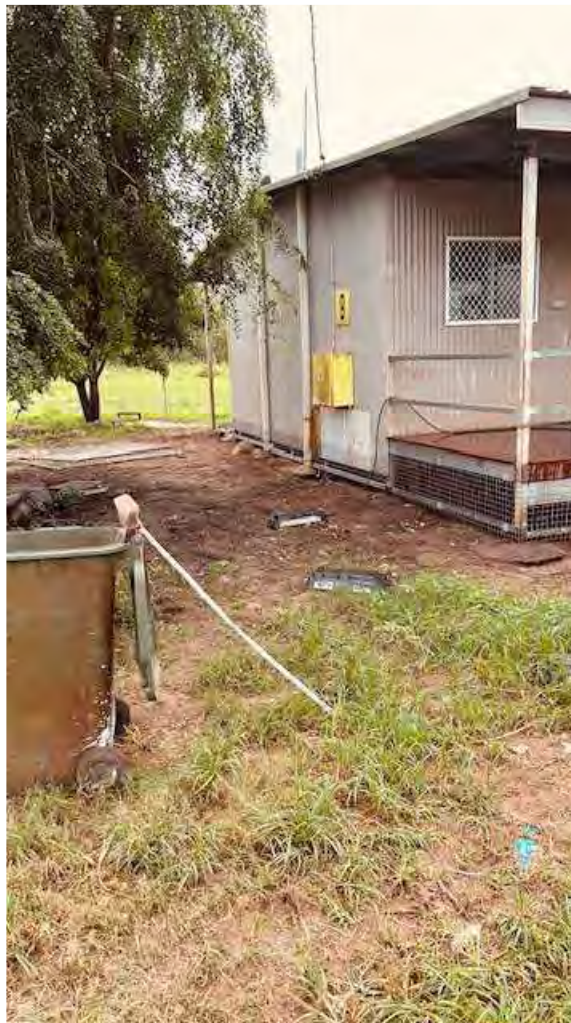
House 9 - Ngangalala